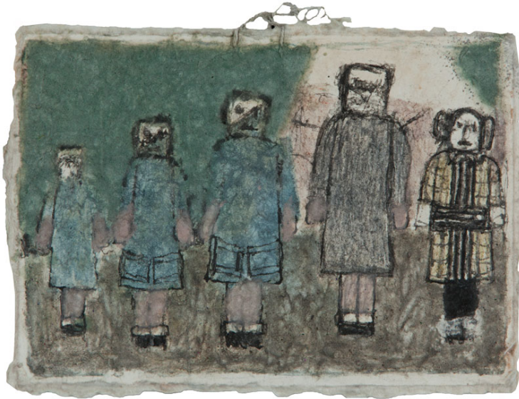
Untitled (Five Figures)