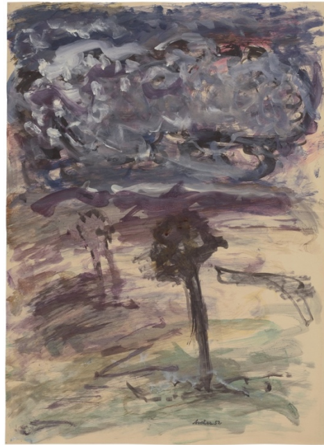
Two Trees, 1952, White gouache over black ink and watercolor on paper, 24.5 x 17.75 in.